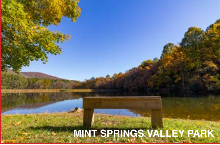
MINT SPRINGS VALLEY PARK