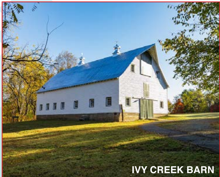
IVY CREEK BARN