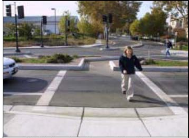
Well designed median controls and directs both vehicular and pedestrian traffic.