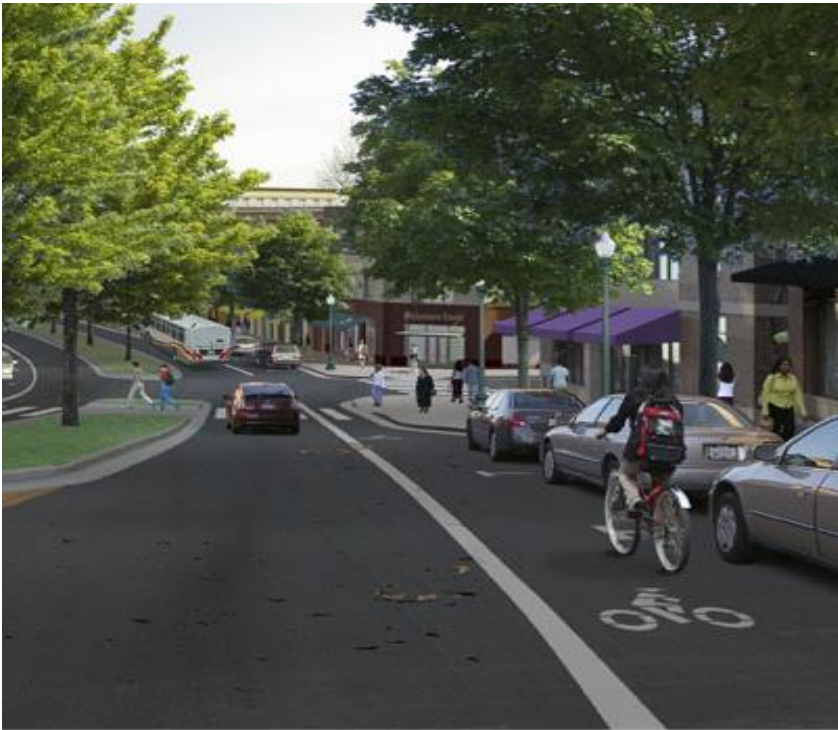
Figure 2.2. A photosimulation illustrating several transportation guiding principles: a transit-friendly neighborhood street with bicycle lanes, and parked cars separating traffic from the sidewalk.