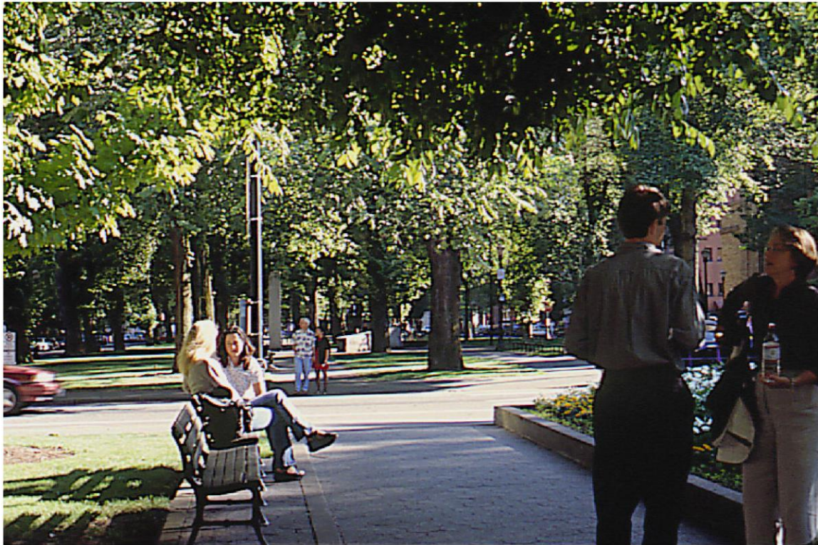
Figure 2.3. A photograph of a public open space with pedestrian amenities.