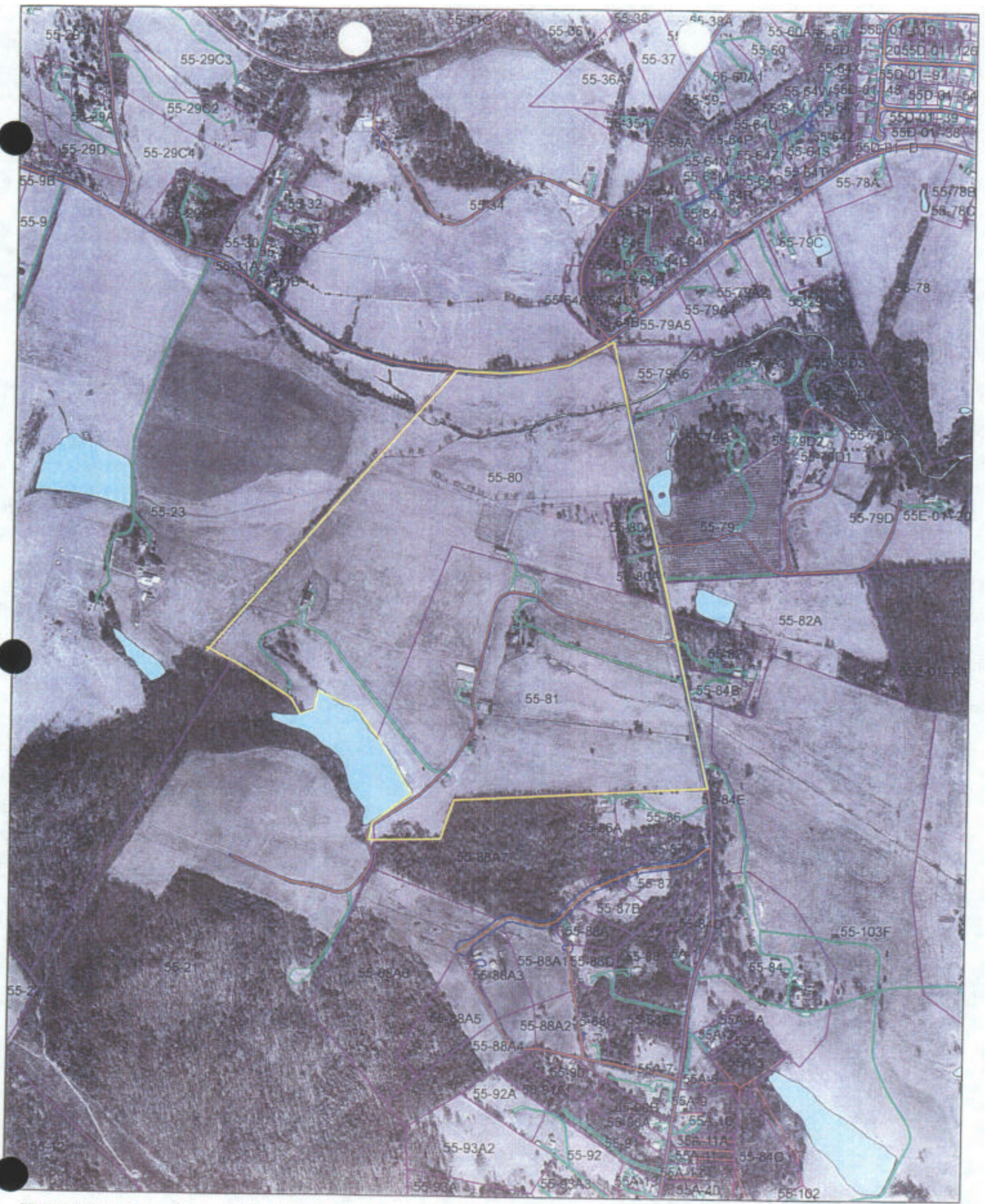
SP 2006-03 American Cancer Society's Pink Ribbon Polo Attachment B. Site Context Drawing