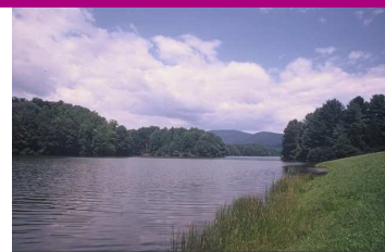
Beaver Creek Lake

Visit http://www.albemarle.org/parks or call 434-296-5844 for the most up-to-date Parks and Recreation information.