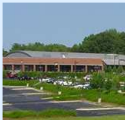
1600 5th Street

Here in Albemarle County, we focus on customer service and work to make our services as accessible and convenient as possible. At both our McIntire Road and 5th Street locations, you will find staff who are available and ready to answer your questions and respond to your service needs. Here are some examples of easy ways you can do business with us next time you come to one of our County Office Buildings: