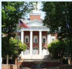
401 McIntire Road