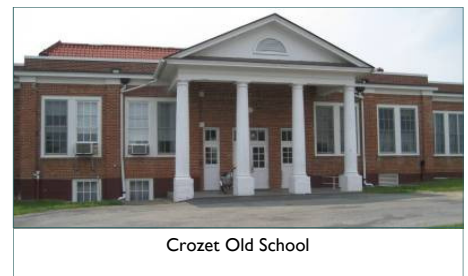
Crozet Old School

June 20, 10:00 a.m.-6:00 p.m.; June 21, 9:00 a.m.-3:00 p.m.: Citizens had the opportunity to drop in and discuss their ideas with PMA in a less formal setting. During this time, PMA architects were also working on conceptual drawings representing how citizen ideas and priorities might fit together in the building/on the site.