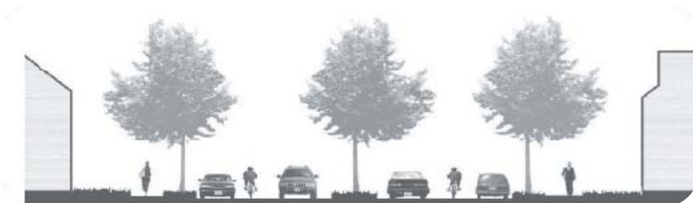
Typical Section for an Avenue

“Eastern Avenue” is also a new street expected in Crozet. “Eastern Avenue” will extend from Three Notch’d Road to Route 250 West through the existing Cory Farm development and will involve a bridge over Lickinghole Creek, a bridge or underpass to cross the CSX tracks to the north, and numerous connections to neighborhood streets. “Eastern Avenue” has been recommended in County plans for over 30 years, and right-of-way for this street has been dedicated or reserved in some places. It is expected to be built by developers during construction of their projects, except for the bridge over Lickinghole Creek. Aside from construction, truck traffic should not be allowed on this road which will function as an avenue. Construction phasing is prioritized to begin at the northern end of the project, connecting to the new “Main Street”.