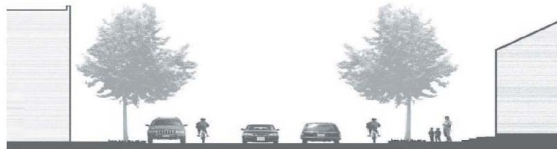
Typical Section for an Urban Street

Three Notch'd Road is a two-lane road that extends from the V-intersection with Route 250 West, east of Crozet, to its intersection with Crozet Avenue at the four-way stop sign in Downtown. In places it is and will continue to be an urban section road as illustrated below. An urban section with curb, gutter, sidewalks, and street trees is expected with redevelopment between Park Ridge Drive and Downtown inside the Development Area. Turn lanes are not expected on this street.