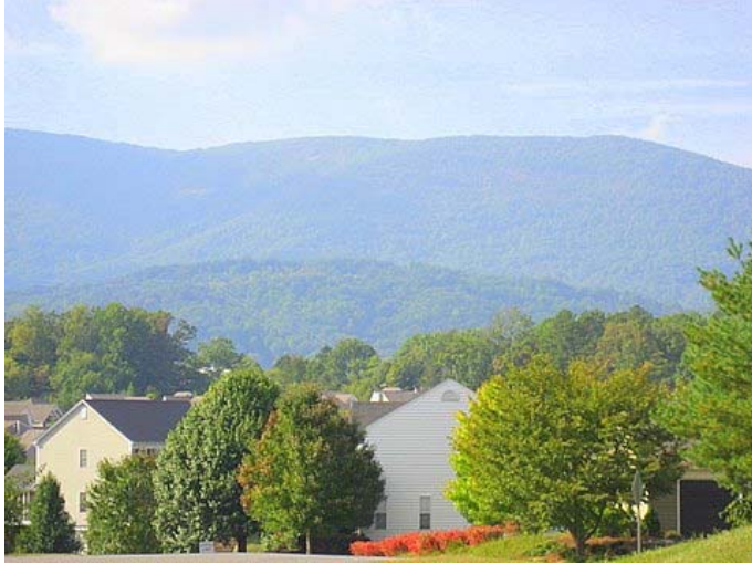
View west of the Blue Ridge Mountains from Crozet

The most scenic resource in Crozet is the Blue Ridge Mountains located west of the community. These mountains are visible from most parts of Crozet and are one of the reasons new residents are attracted to Crozet. The County's Rural Area policies help to preserve this scenic resource through policies and programs like the Mountain Protection Plan, conservation easements and agricultural and forestal districts.