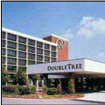
DoubleTree Hotel & Convention Center 990 Hilton Heights Road Charlottesville, Virginia 22901