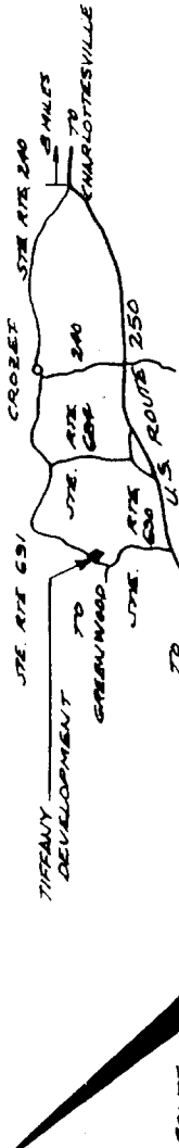
LOCATION MAP SCALE: 1" = 2 MILES